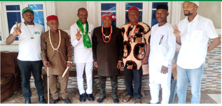
Imo P4P state Team

These interventions remind us that the path to peace is paved with understanding, communication, and collaboration. We extend our heartfelt gratitude to all participants and stakeholders who made these initiatives possible.