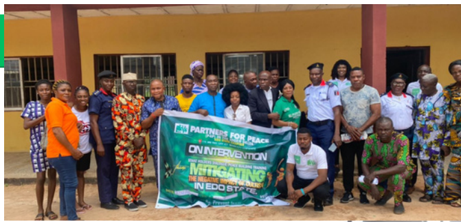
Edo P4P Prevent Team