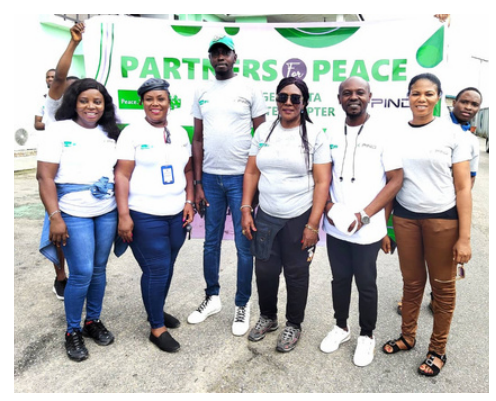
P4P network members