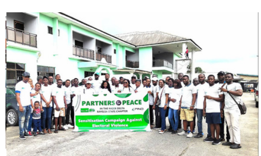
P4P network members