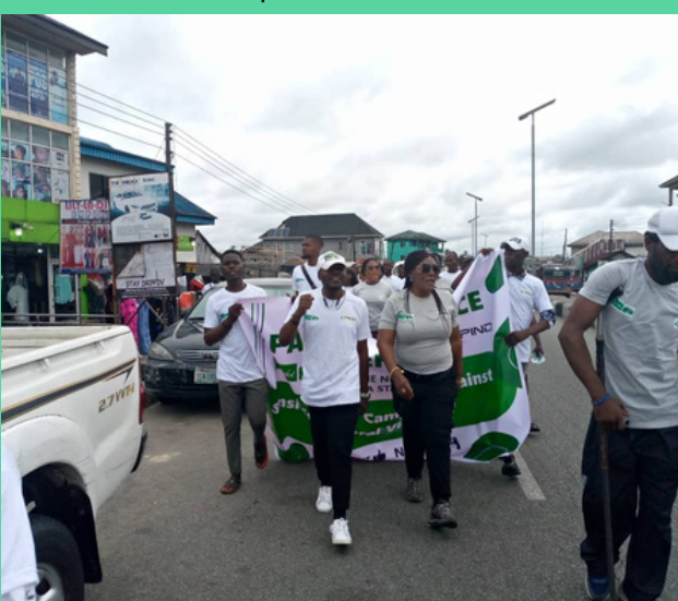
P4P network members

Our activities encompassed community sensitization, conflict resolution workshops, and targeted outreach programs. Through these efforts, we aim to create a safer and more inclusive environment for all residents. P4P Rivers State Chapter remains steadfast in its dedication to a more peaceful and secure Rivers State.