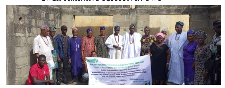
PARTICIPANTS OF THE STAKEHOLDERS OPEN COMMUNITY MEETING ONDO STATE