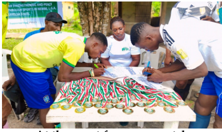
At the sport for peace match